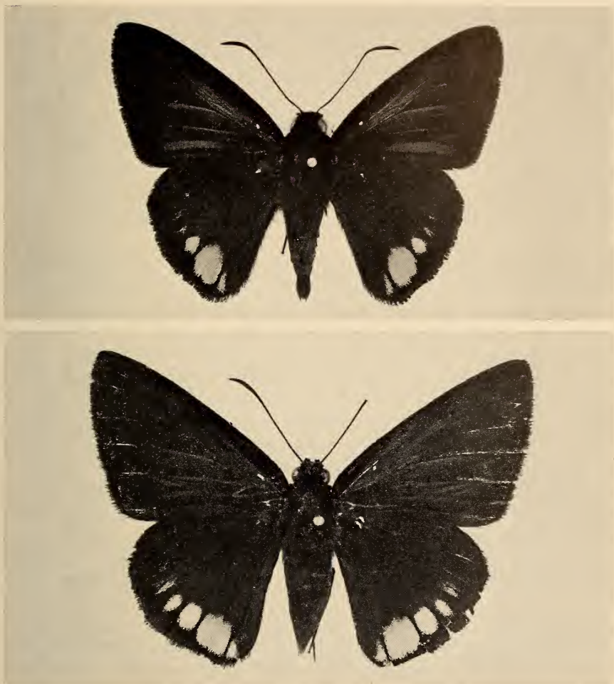
Figs. 1-2. Pyrrhopyge creon lilliana Nicolay & Small. Fig. 1 (upper), holotype male. Fig. 2 (lower), allotype female.

most lepidopterous species lilliana is active during those intervals in which the sun is shining. These intervals tend to be frustratingly few and far between. Furthermore, lilliana only flies from about 9:30 A.M. to 12:30 P.M. so that the actual time available to collect individuals of this species in any given day is rather small.